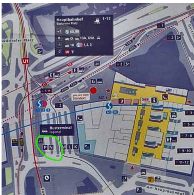
In Wien Hauptbahnhof